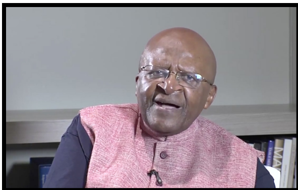
▶ The Most Reverend Desmond Tutu Archbishop Emeritus of Cape Town

What do experts and world leaders think about the rule of law—and the World Justice Project’s efforts to measure it? In 2014 we asked several leading global voices for their thoughts. Watch the videos here.