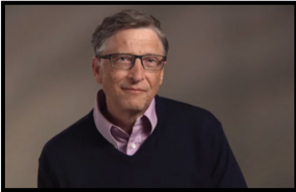
▶ Bill Gates Co-chair and Trustee Bill & Melinda Gates Foundation