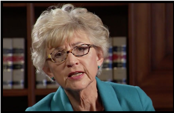
▶ The Right Honorable Beverley McLachlin, P.C. Chief Justice | Supreme Court of Canada