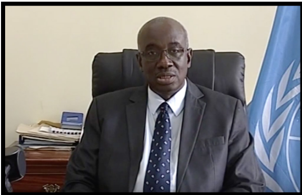
▶ The Honorable Justice Hassan Bubacar Jallow UN International Criminal Tribunal for Rwanda (UNICTR) | Rwanda

"The Rule of Law Index provides guidance in an objective manner, as a universal standard for self-evaluation and assessment, and as a compass for steering our nations forward, in demand for social, political, and economic justice and advancement."