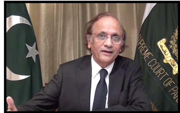
▶ Mr. Justice Tasadduq Hussain Jilani Honorable Chief Justice of Pakistan