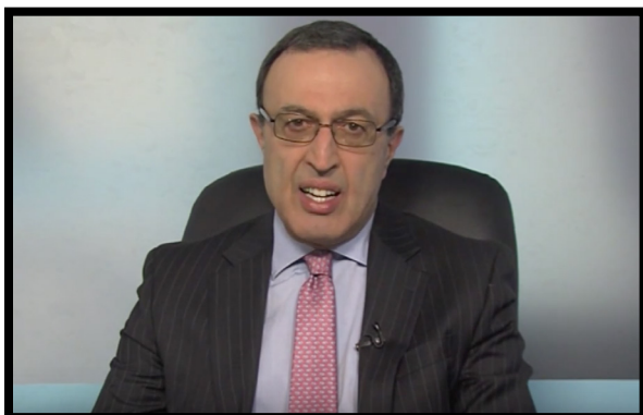
▶ The Honorable Petar Stoyanov Former President | Bulgaria