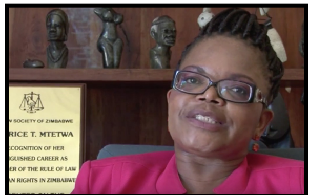
▶ Beatrice Mtetwa Human Rights Lawyer | Zimbabwe