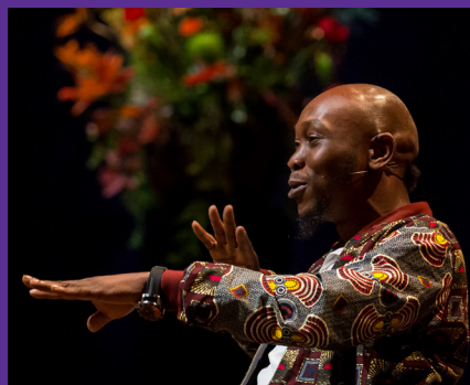
Top photo: Seun Kuti; World Justice Forum 2019, World Justice Project