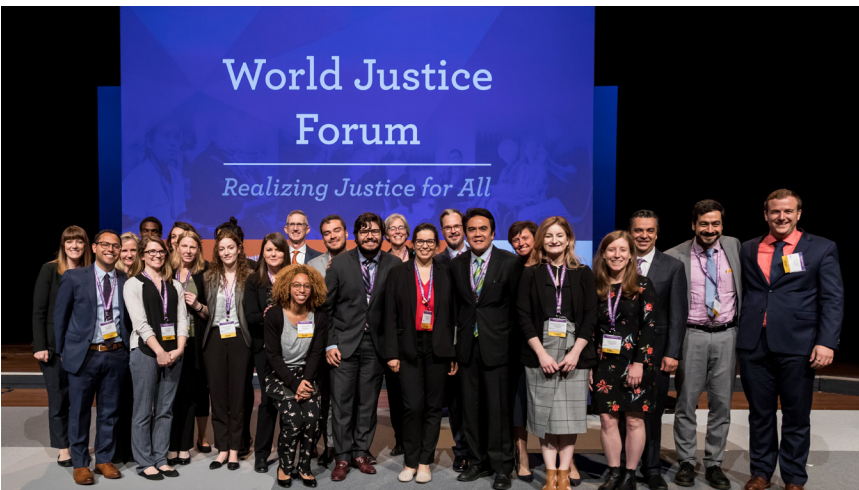
World Justice Project Staff World Justice Forum 2019