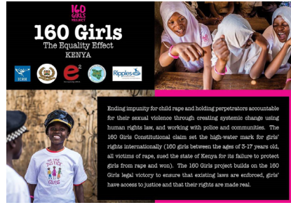
Photo: 160 Girls Access to Justice Project from Kenya; World Justice Challenge Winner

Monitoring Maternal Health Entitlements and Increasing Access to Grievance Redressal, a World Justice Challenge-winning project by Nazdeek (India), provides access to grievance mechanisms to strengthen health outcomes. Tea plantation workers in the state of Assam suffer from the highest mortality rates in India, and their work conditions are a direct cause. Nazdeek organized community-led grievance forums in order to identify, monitor, and address rights violations and provide a mechanism for the community to solve their health problems collectively.