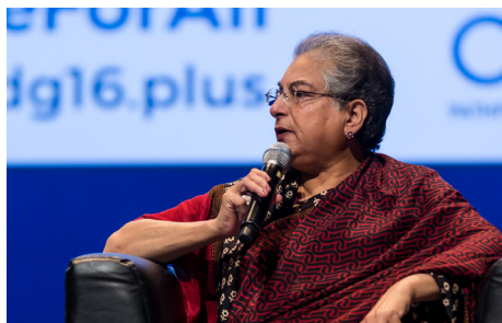
Photo: Hina Jilani of the Elders and Co-Chair of the Task Force on Justice; World Justice Forum 2019, World Justice Project

People-centered justice data is required for evidence-based policymaking and investment as well as the SDG's focus on monitoring and measuring progress. As Hina Jilani of the Elders and Co-Chair of the Task Force on Justice stated, "we... need data to tell us where people's justice problems lie, so that efforts can be targeted at the most important problems and tailored to those groups that are most in need."