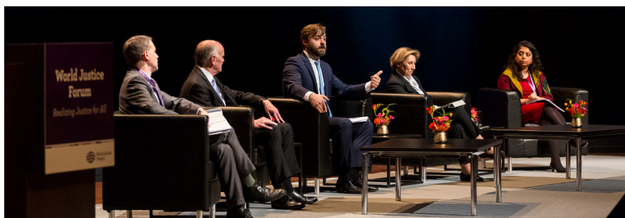
Photo: Plenary discussion; World Justice Forum 2019, World Justice Project