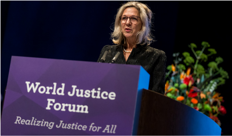
Photo: Birgitta Tazelaar, Deputy Director-General for International Cooperation at the Netherlands Ministry of Foreign Affairs; World Justice Forum 2019, World Justice Project