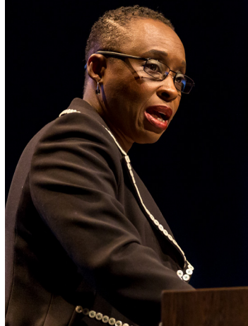
Photo: Priscilla Schwartz, Sierra Leone Attorney General and Minister of Justice; World Justice Forum 2019, World Justice Project

The year 2019 has been characterized as the year of justice: an opportunity to transform justice delivery systems and provide access to justice to billions more people worldwide. The launch of these two reports at the World Justice Forum underscores the magnitude of the task, but also the specific opportunities and approaches to accomplish it.