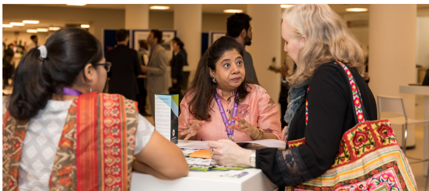
Photo: Expo Village; World Justice Forum 2019, World Justice Project