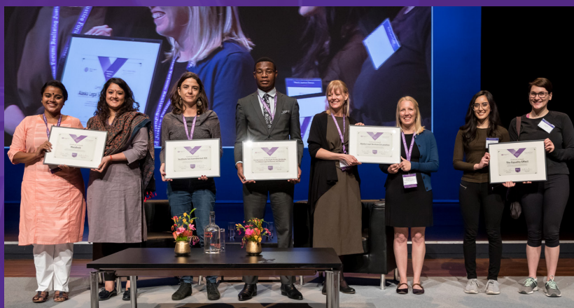
Photo: World Justice Challenge Winners 2019; World Justice Forum 2019, World Justice Project

Congratulations to the 2019 World Justice Challenge: Access to Justice Solutions Winners!