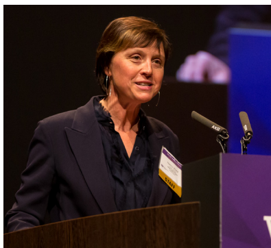
World Justice Forum 2019, World Justice Project

the Forum has become a dynamic place of work, exchange, and learning for organizations working on the rule of law around the world.