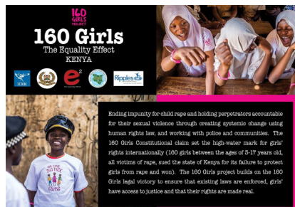
Photo: 160 Girls Access to Justice Project from Kenya; World Justice Challenge Winner

Monitoring Maternal Health Entitlements and Increasing Access to Grievance Redressal, a World Justice Challenge-winning project by Nazdeek (India), provides access to grievance mechanisms to strengthen health outcomes. Tea plantation workers in the state of Assam suffer from the highest mortality rates in India, and their work conditions are a direct cause. Nazdeek organized community-led grievance forums in order to identify, monitor, and address rights violations and provide a mechanism for the community to solve their health problems collectively.