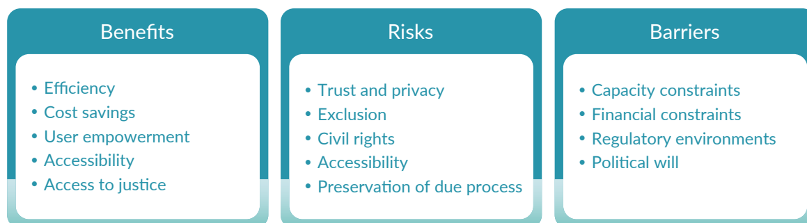
Figure 1: Summary of Benefits, Risks, and Barriers Relevant to Justice Technology

Current justice technology uptake and implementation varies by country and context. In order to incorporate a geographic lens into the literature review, the mapping of literature to the category of legal needs addressed was done via a matrix, so that examples of justice technologies were mapped based on the types of legal needs they addressed and the geographic regions from which they originated. There are examples of justice technology initiatives from all regions of the world and in all economic contexts. However, the literature suggests that justice technology initiatives are more common in relatively wealthier and more digitally connected contexts. Furthermore, the types of justice technology initiatives pursued in a given context may depend on broader justice or governance strategies.