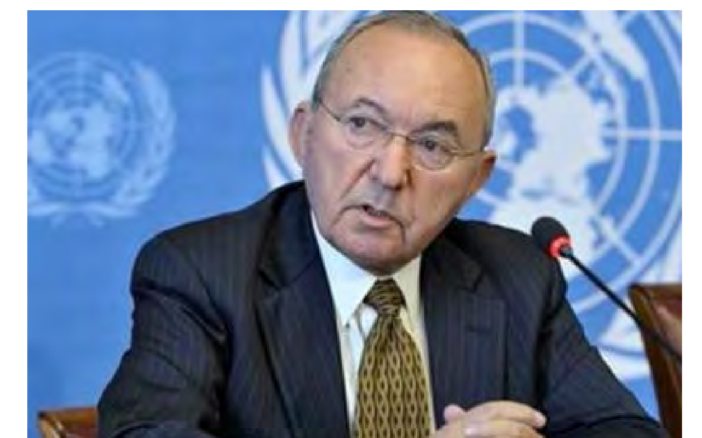
Justice Richard Goldstone of the Constitutional Court of South Africa